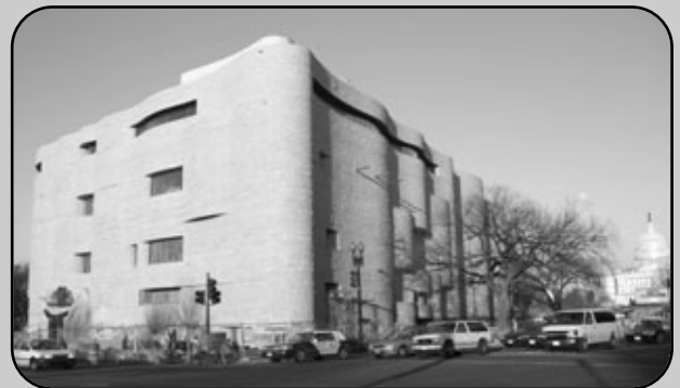
Southwest corner of the Museum of the American Indian

The National Museum of the American Indian on the National Mall in Washington, DC will debut on September 21, 2004, after the culmination of nearly 15 years of planning and collaboration with tribal communities from across the Western Hemisphere. The Museum's grand opening will include a Native Nations Procession, Opening Ceremonies and First Americans Festival, a six-day event featuring Native performers, dance, music, storytelling, and demonstrations. Timed free passes will be needed for the Museum due to expected crowds and some small gallery spaces. Advance passes are available at www.americanindian.si.edu or at tickets.com or by calling 866-400-NMAI (6624) for a fee of $1.75 per ticket plus a $1.50 service charge per order. For more information on opening week events, visit the museum's web site: www.americanindian.si.edu .