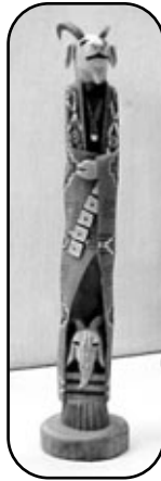
Navajo folk art