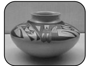
Hopi pottery bowl

POTTERY, another ancient craft, can range from traditionally shaped pots painted with designs that have been passed down for generations, to elegant, contemporary plates with textures that look like sand dunes. Some potters use ancient designs that today appear modern and abstract, while others may carve realistic