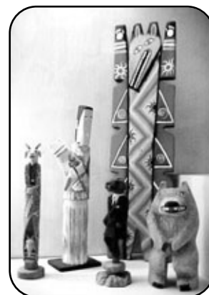
Assortment of Navajo folk art