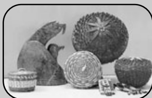
Assortment of Iroquois art

American Indian Beadwork, Pueblo Pottery, American Indian Sculpture, Arts of Alaska, Innovators in SW Jewelry