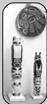
Chilton family art