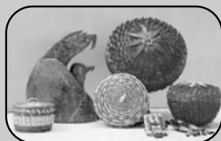
Assortment of Iroquois art

American Indian Beadwork, Pueblo Pottery, American Indian Sculpture, Arts of Alaska, Innovators in SW Jewelry